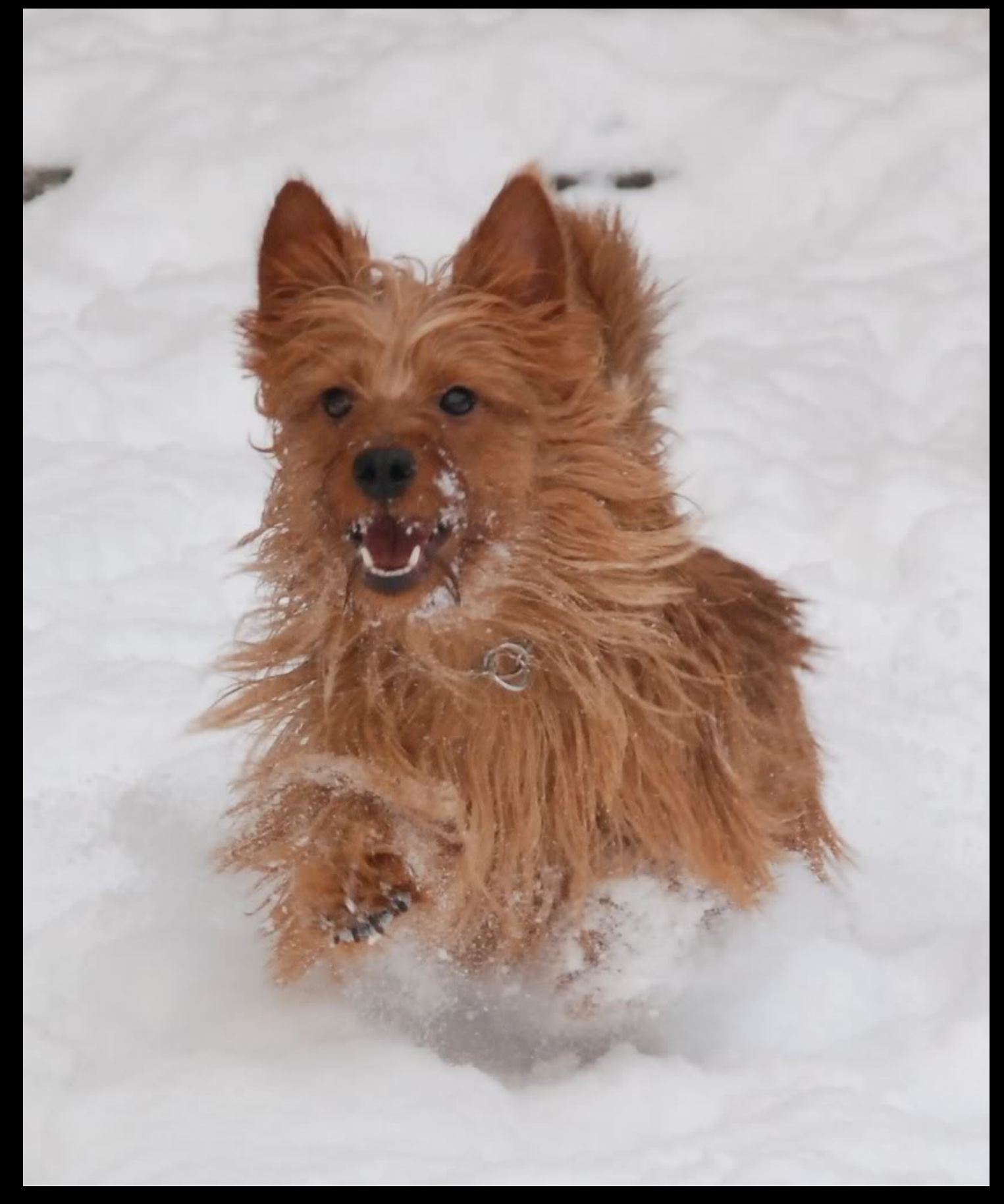
Happy Holidays Henny van den Berg (The Netherlands)