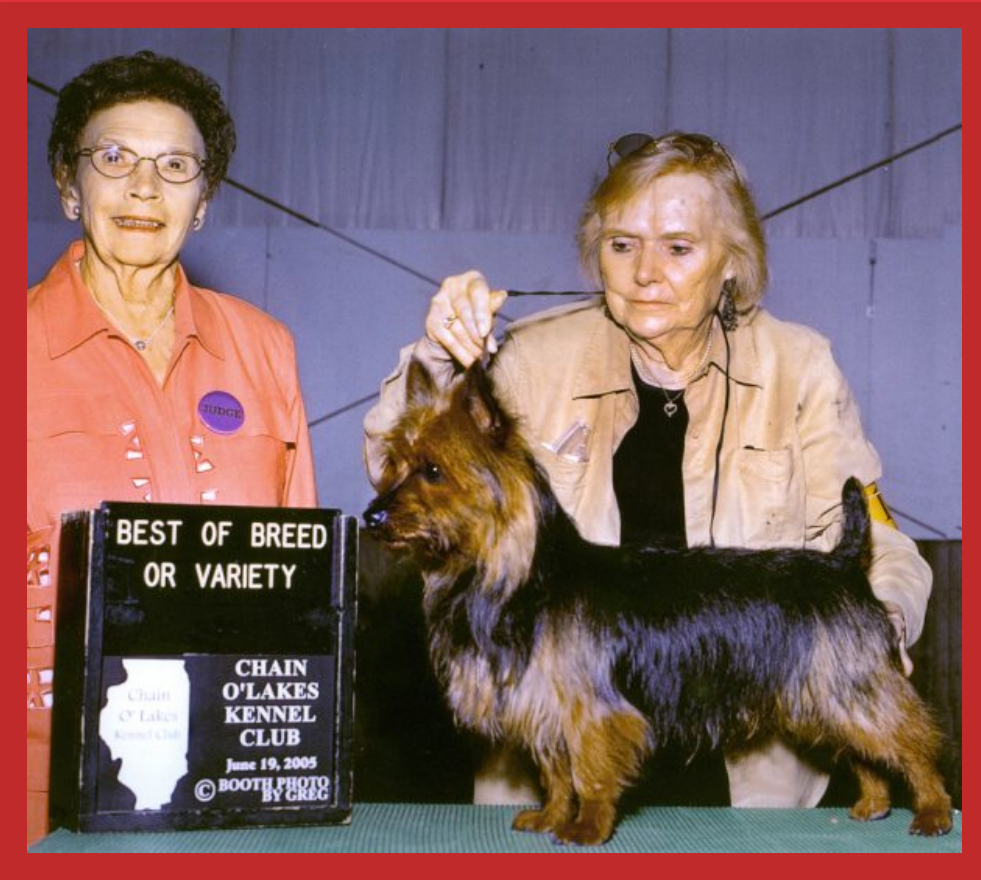
My Dogs Live Here

My dogs live here, they're here to stay. You don't like pets, be on your way. They share my home, my food, my space; This is their home, this is their place.