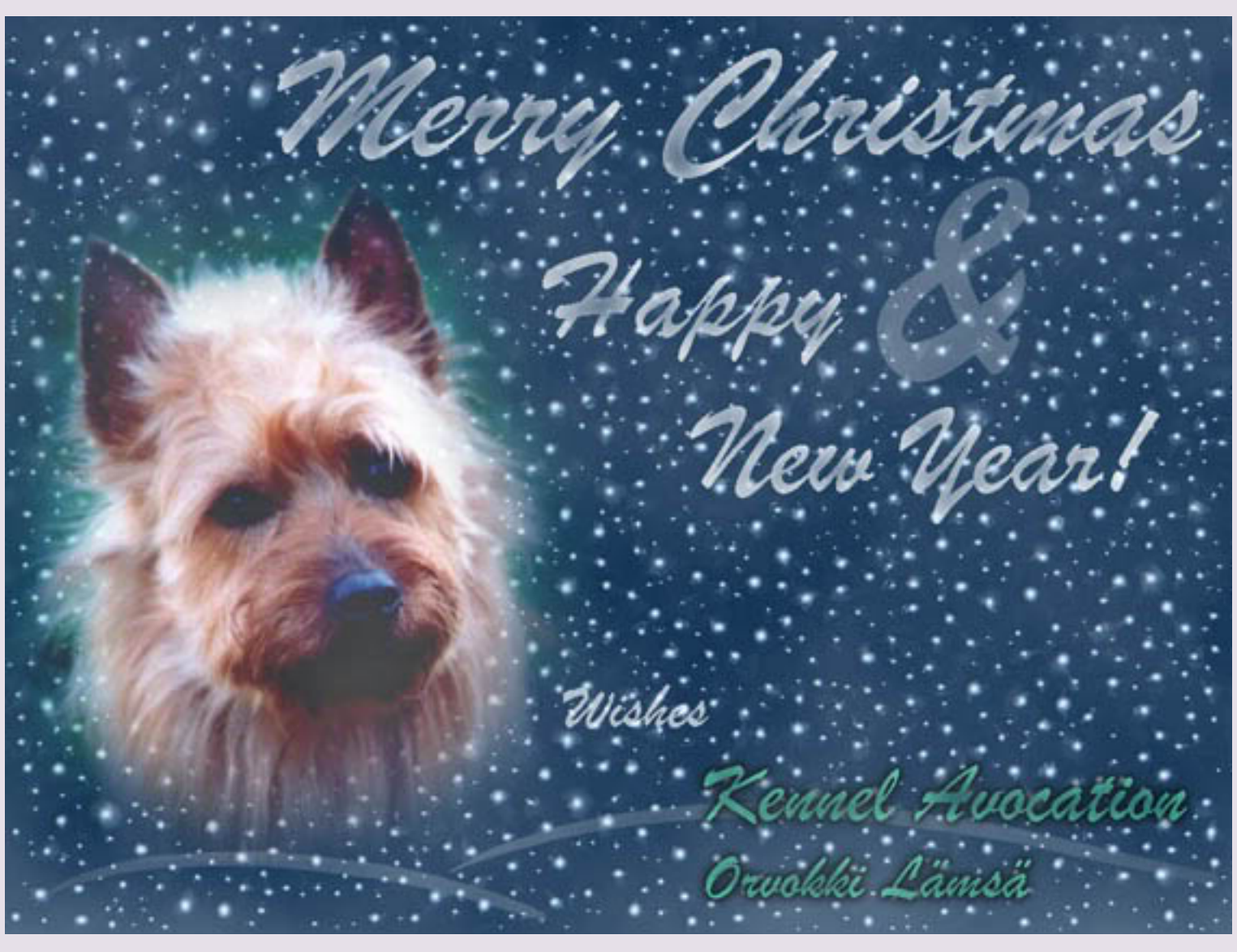
Kennel Avocation and Orvokki Lamsa (Finland)