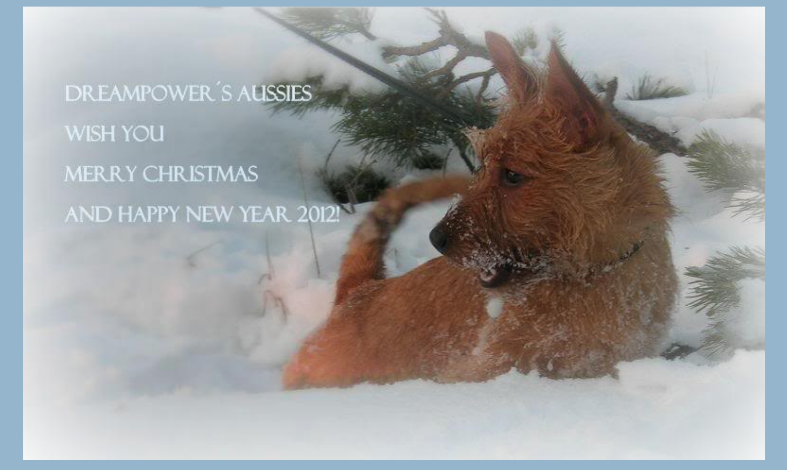
Satu Toivonen and Dreampower Aussies (Finland)