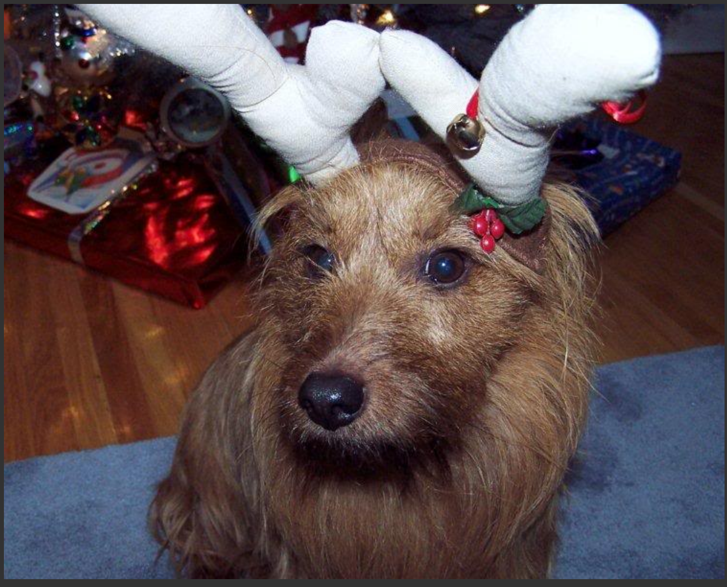
Zane and Terri Butchkavitz wish everyone a Fabulous 2012! (USA)