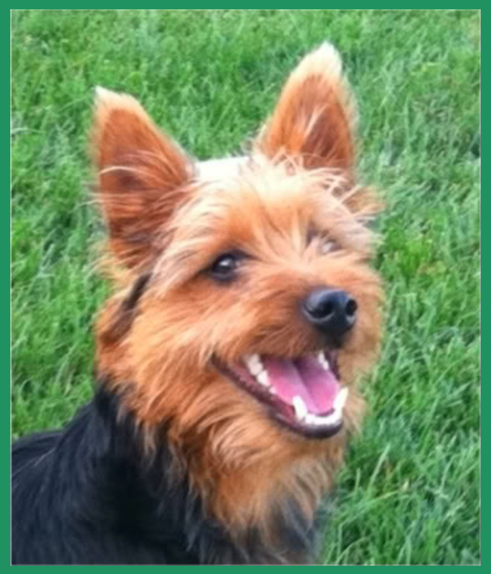
I'm a Forever Dog Not An "Until" Dog.

I'm not an "until you get bored with me" dog. I'm not an "until you find a boyfriend" dog. I'm not an "until you have a baby" dog. I'm not and "until you have to move" dog. I'm not an "until you have no time for me" dog. I'm not an "until I get sick and cost me money" dog.