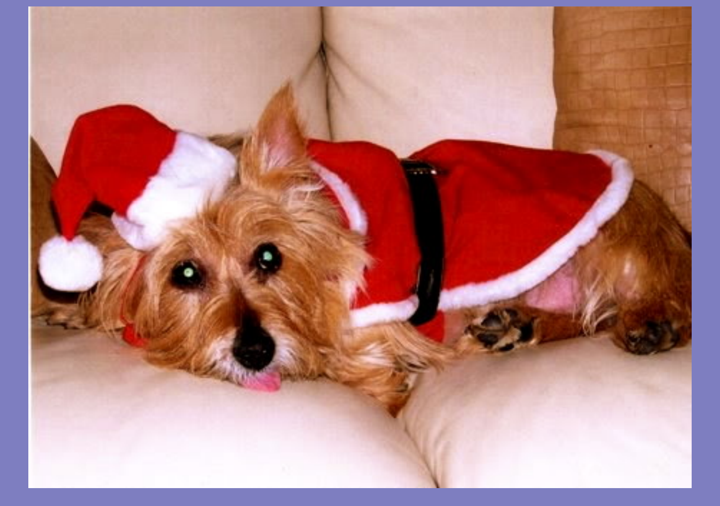
Ch Akiba's Perfect Alibi (RB)