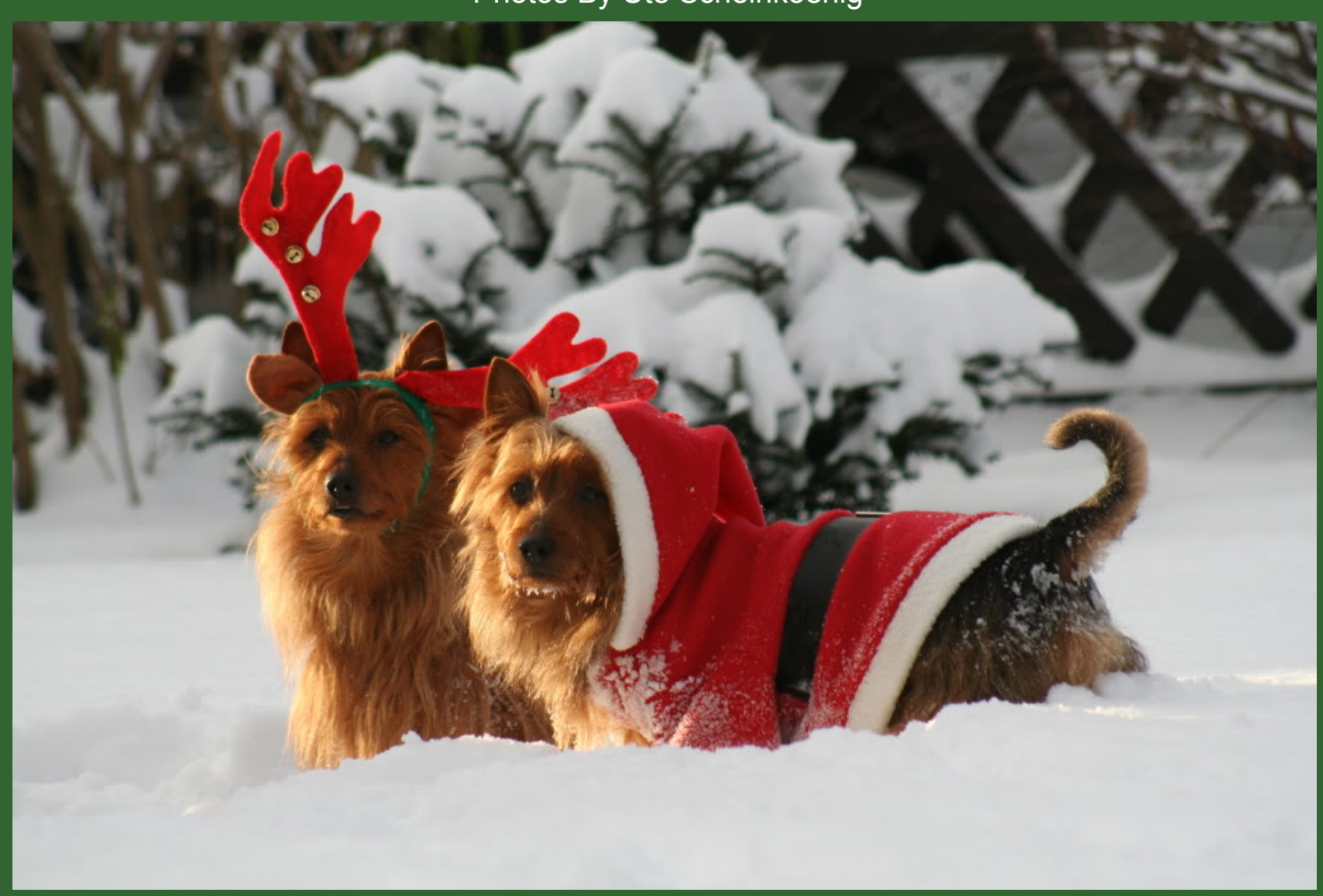
Anton, Flash and I wish you all a Happy 2012. Ute Scheinkoenig (Germany)