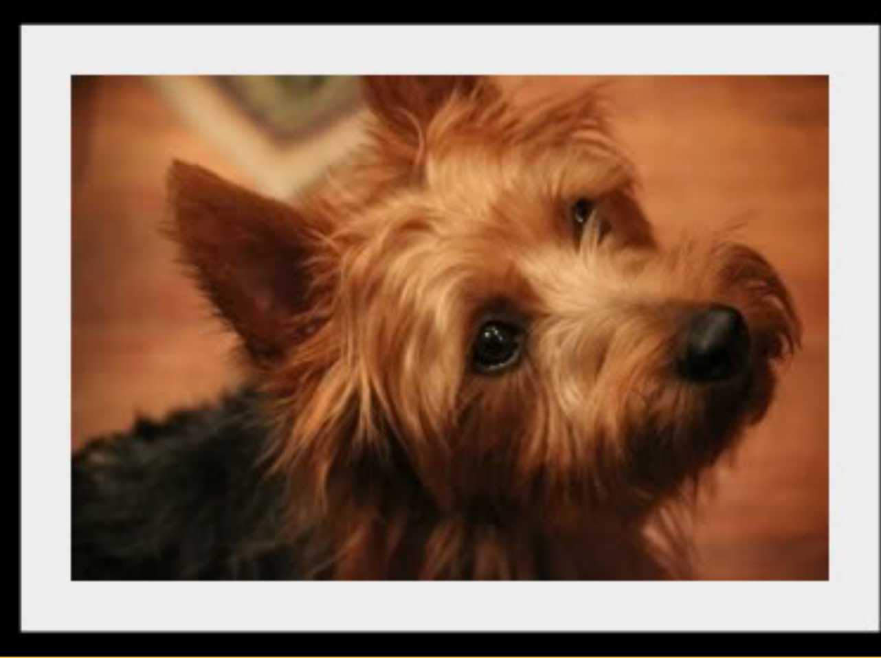
Happy Holidays to all puppy lovers throughout the world from us! Jan Bosch and Teddy (USA)