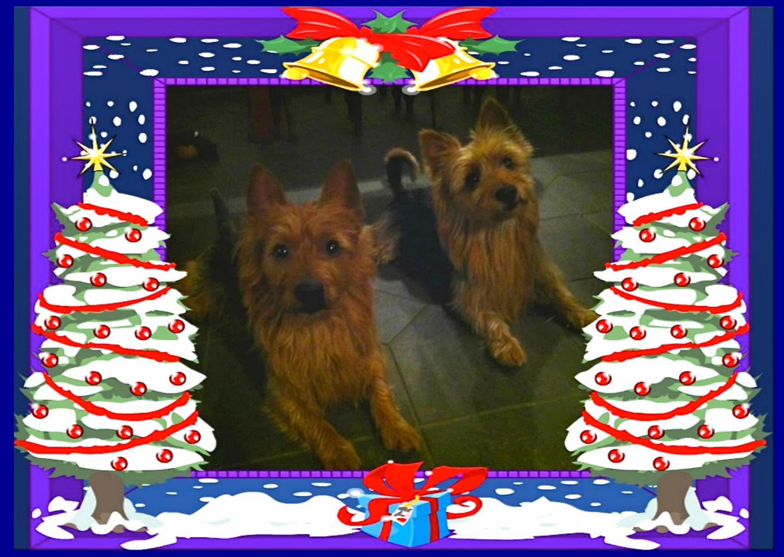
Happy Holidays To All! Bethina Gade (Denmark)